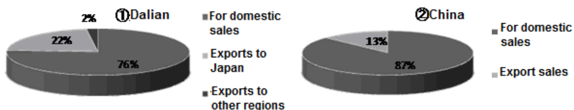
Figure 1: Breakdown of markets for the software and information services industries of Dalian and China, 2009